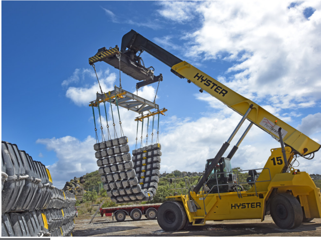
Hyster reach stacker