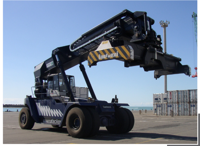
Fantuzzi reach stacker

Designed for fast handling of containers and loads, our two reach stackers are agile and flexible, and fitted with spreaders that can be used to transport project cargo and even small vessels.